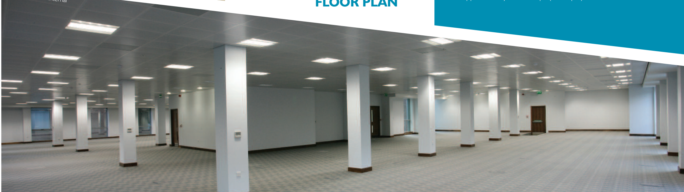
Indicative office internal

NORTHMINSTER BUSINESS PARK • YORK • YO26 6QU